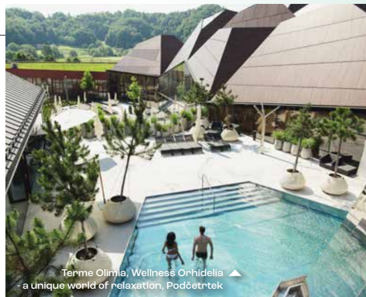
Terme Olimia, Wellness Orhidelia - a unique world of relaxation, Podčetrtek ▲

Right on the edge of the plain that leaves its mark on Central Europe, you'll find numerous Slovenian spas and health resorts. They are nestled among gentle hills where grapevines have been grown for millennia. Thermal Pannonian Slovenia is home to authentic and heartfelt cuisine.