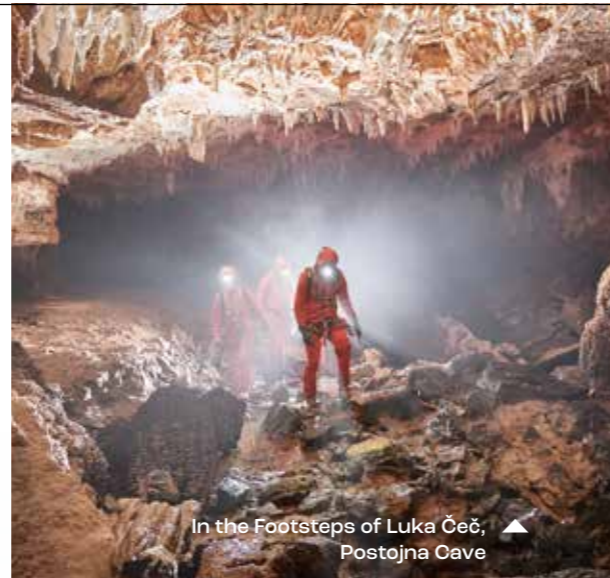
In the Footsteps of Luka Čeč, ▲ Postojna Cave

When it comes to tourism, Slovenia has been systematically developing individual boutique experiences in accordance with its strategic goals for years. Slovenia's most significant tourism products are based on ensuring the privacy of guests and fulfilling their wishes. This is another reason why you can experience Slovenia your own way!