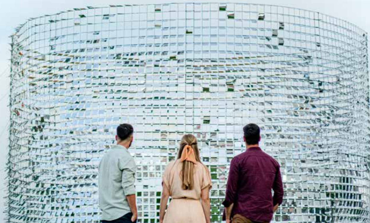
▼ Art Stays Festival of Contemporary Art 2019, The origin of the wind by Yu Kato, Ptuj

Nature and culture. Cities, towns and villages where you just feel good. Where you spend your leisure time actively. Where you enjoy art in your own way and embark on a journey through different times and places. These elements form the essence of the quality of life in Slovenia. They contribute to the hospitality of a diverse, green and sustainable country full of unique experiences. Welcome!