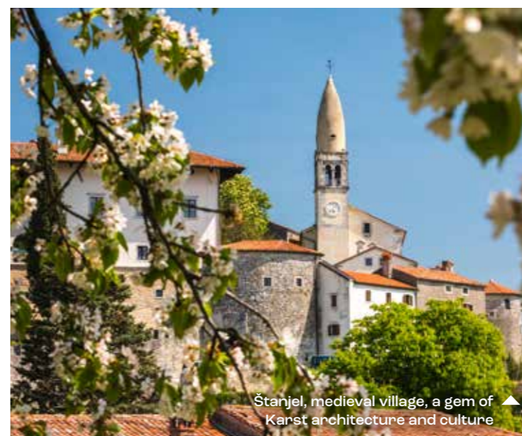
Štanjel, medieval village, a gem of Karst architecture and culture ▲

From Ljubljana, the capital of Slovenia, to incredible forests and forest reserves – here, you'll see places that belong to the world UNESCO heritage. In Ljubljana & Central Slovenia you'll find a unique vibe of urban culture and events as well as the serenity of the green countryside at the same time.