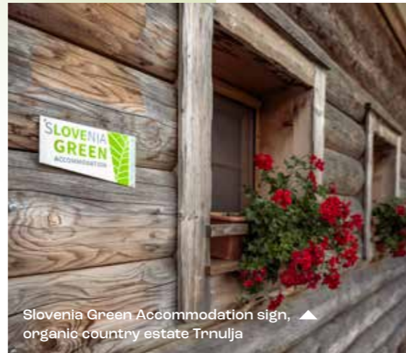
Slovenia Green Accommodation sign, ▲ organic country estate Trnulja

As one of Europe's most water-rich countries, Slovenia also takes pride in its exceptional quality of drinking water. As such, the country made history by being the first European country to constitutionally recognize the right to water. Furthermore, under the slogan "Less plastics, more sustainability," Slovenian tourism abandons the use of plastic bottles, cups and single-use packaging, reaffirming its dedication to environmental preservation.