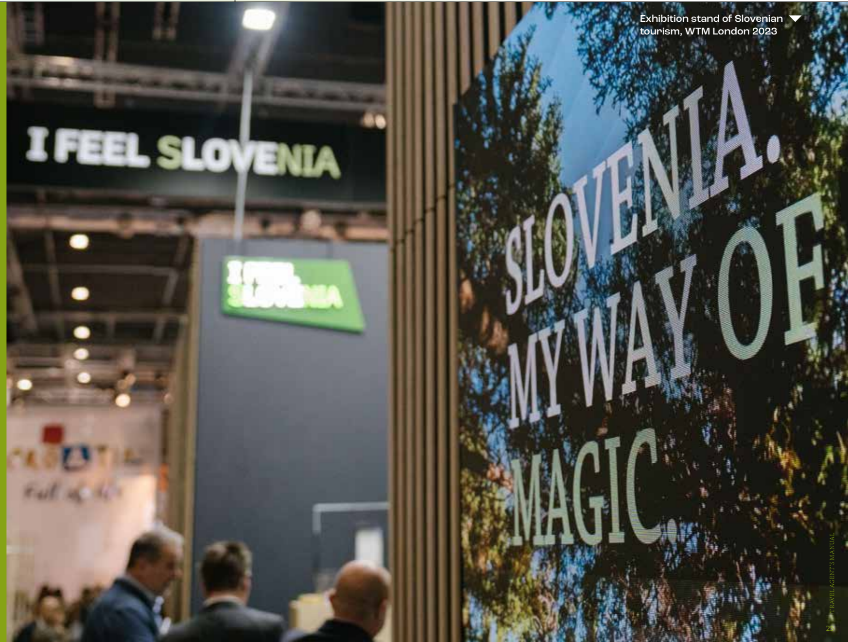
Exhibition stand of Slovenian tourism, WTM London 2023