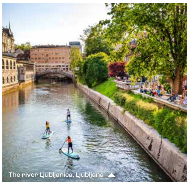
The river Ljubljanica, Ljubljana ▲

Ljubljana, the thriving capital and largest city of Slovenia, earned the prestigious title of the Best European City for Short Breaks in 2023. It boasts a population of less than 300 thousand. Maribor, honoured as the European Capital of Culture, is home to the world's oldest vine. Nova Gorica, set to be the European Capital of Culture GO! 2025 Nova Gorica-Gorizia, thrives on boundless creativity that transcends national boundaries. The cultural tapestry of these three cities is further enriched by Slovenia's 21 historic towns, each adorned with captivating old towns from various historical periods, complemented by majestic castles, intriguing museums and vibrant galleries. Slovenian cities stand out for their architectural excellence and modernist influences, adding a distinctive touch to the nation's cultural landscape.