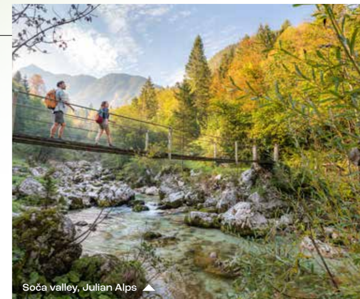
Soča valley, Julian Alps ▲

In addition to the special natural and cultural features of the Alps, protected by one of the oldest national parks in Europe, Alpine Slovenia offers incredible opportunities for various outdoor activities. Here, you can always be in touch with nature!