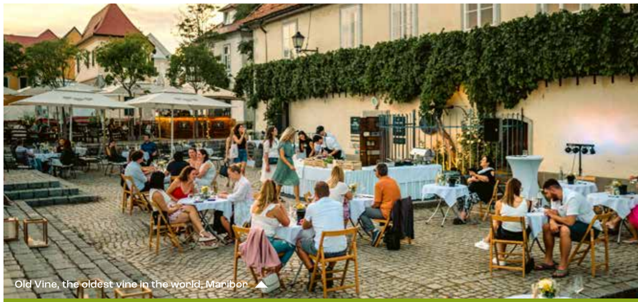
Old Vine, the oldest vine in the world, Maribor ▲