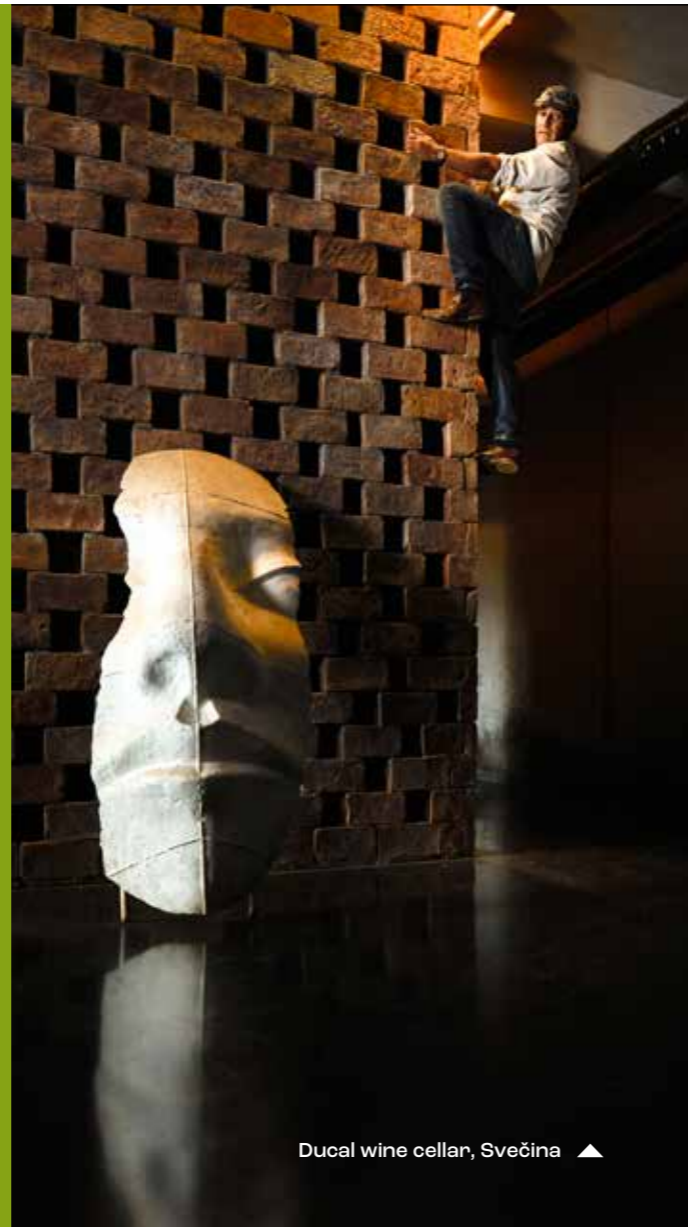
Ducal wine cellar, Svečina ▲

Slovenian natural health resorts, spas and wellness centres are nestled beside ancient thermal mineral water springs with a rich history. Time-tested natural healing elements such as water, peat, the climate, thalassotherapy, salt water and healing salt pan mud are combined with modern medical expertise and a luxurious range of wellness services.