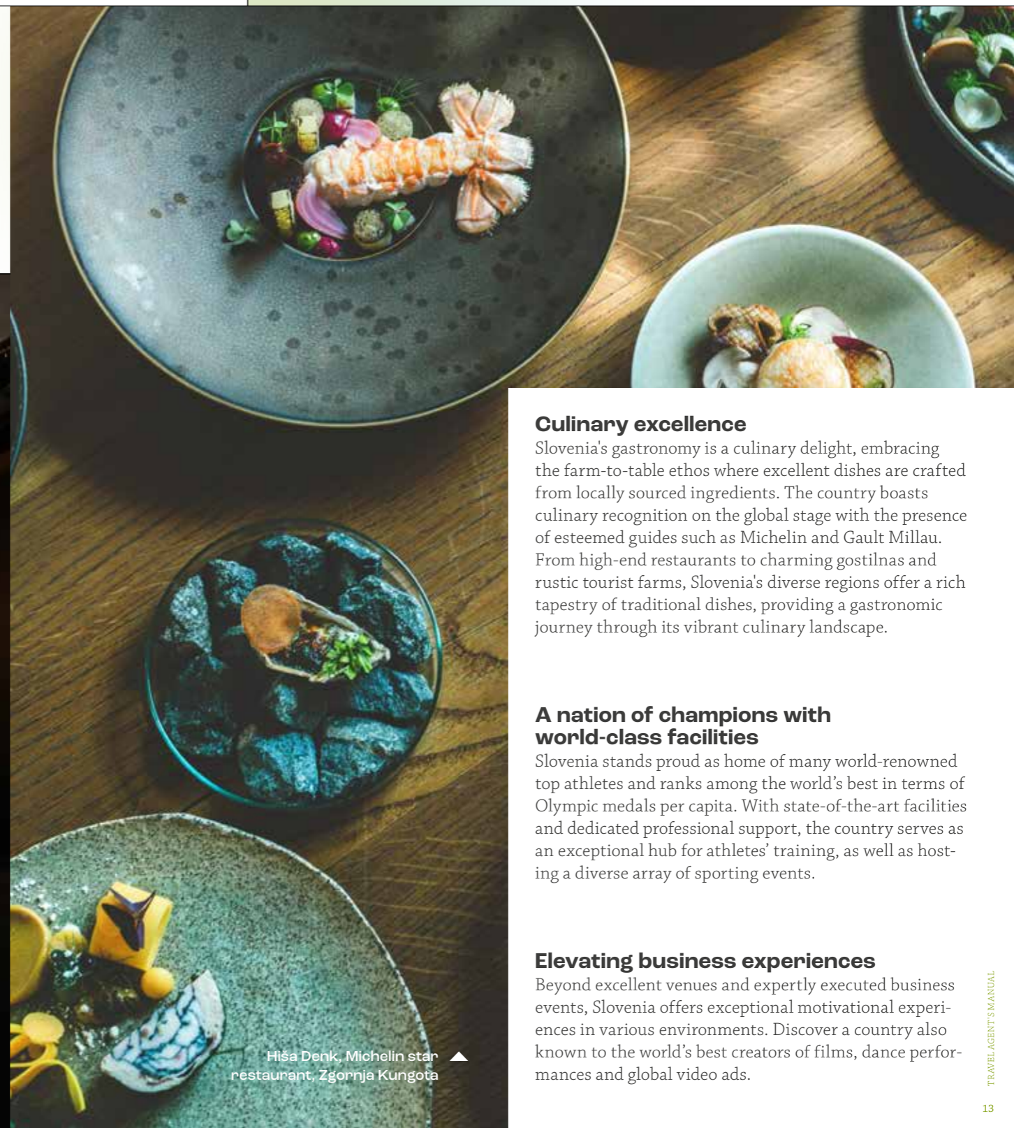
Hiša Denk, Michelin star restaurant, Zgornja Kungota ▲