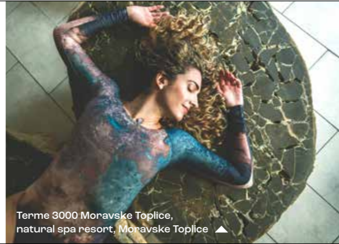
Terme 3000 Moravske Toplice, natural spa resort, Moravske Toplice ▲

Experience a sense of safety, acceptance and hospitality throughout Slovenia. You can count on the timely access to valuable information and the friendly assistance of hospitable locals.