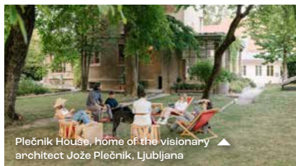
Plečnik House, home of the visionary architect Jože Plečnik, Ljubljana ▲

As you travel from one city to another in Slovenia, nature unfurls its beauty at every turn. Each stop reveals a captivating blend of local charm and historical features. What sets Slovenian towns and cities apart is their unique characteristics, yet they share a common thread of being modest in size and easily navigable. You can measure their essence in steps—quite literally.