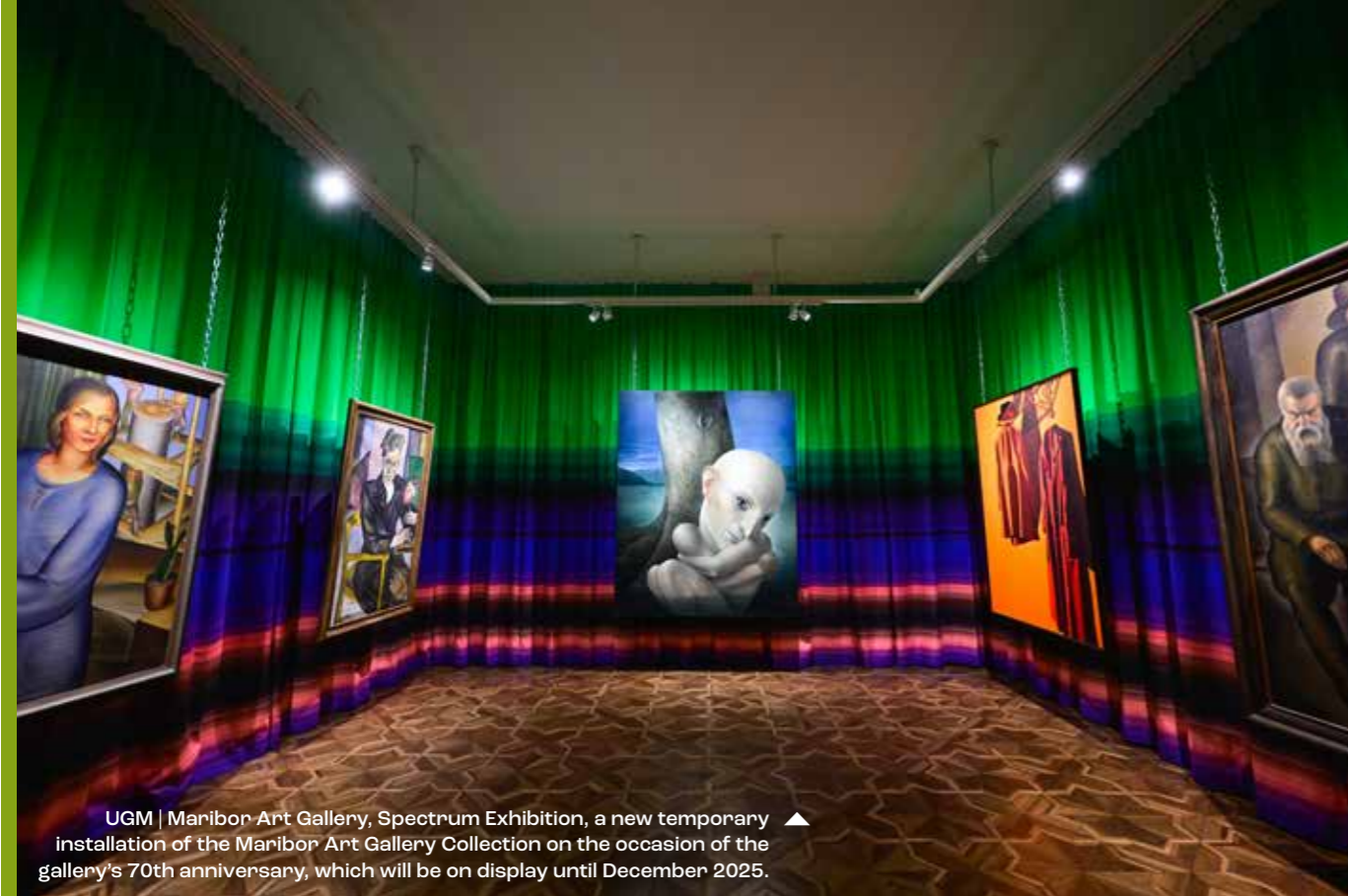
UGM | Maribor Art Gallery, Spectrum Exhibition, a new temporary installation of the Maribor Art Gallery Collection on the occasion of the gallery's 70th anniversary, which will be on display until December 2025. ▲