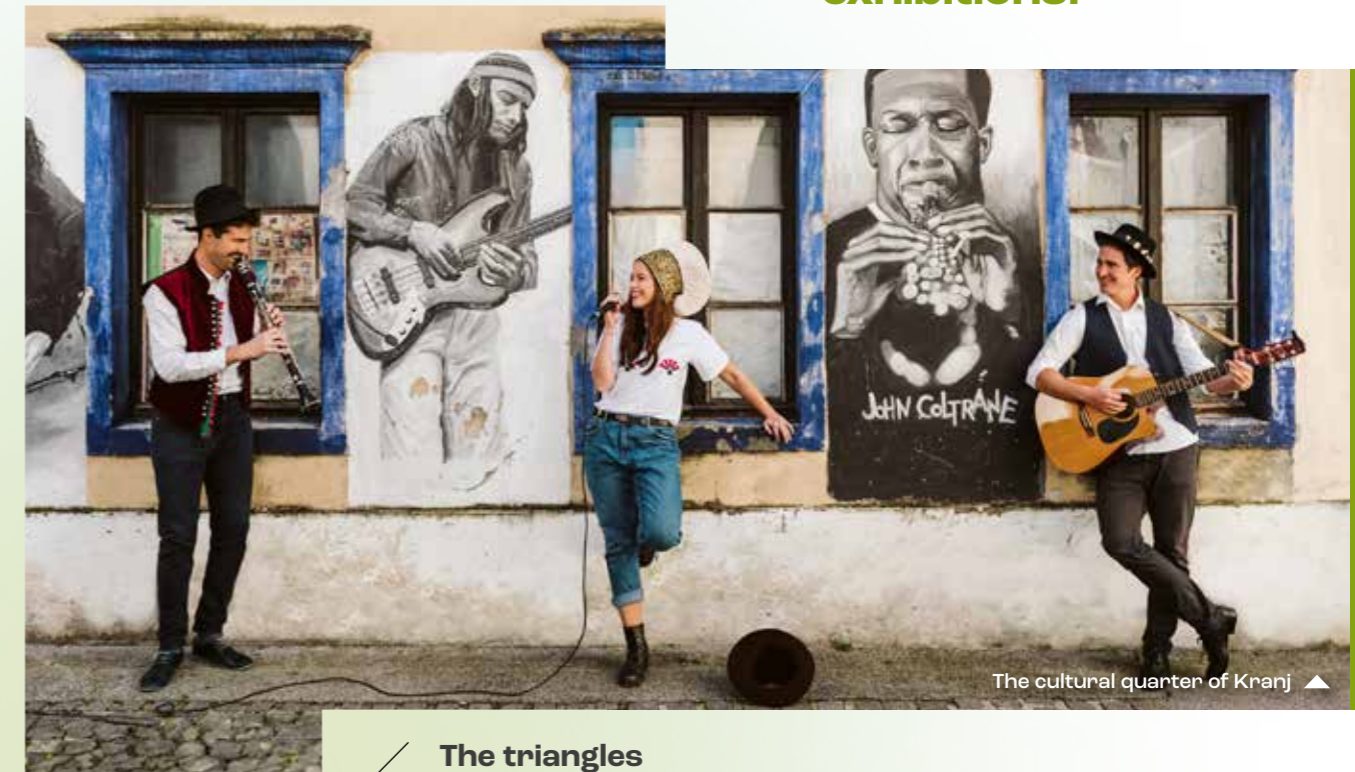
The cultural quarter of Kranj ▲

Almost every world-famous landmark is linked to tourist experiences, events and museum exhibitions.