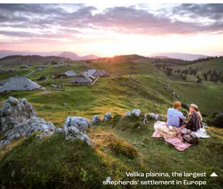
Velika planina, the largest shepherds' settlement in Europe ▲