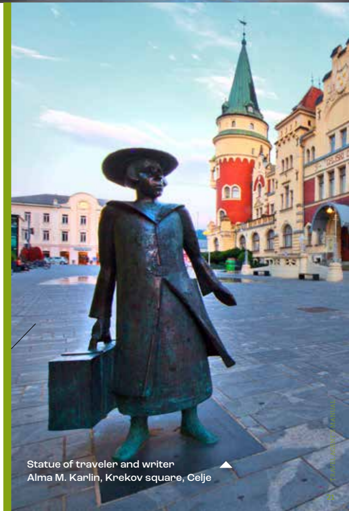
Statue of traveler and writer Alma M. Karlin, Krekov square, Celje ▲

In Slovenia, digital nomads, navigating work and travel seamlessly, connect with the legacy of Alma M. Karlin, an intrepid explorer who circled the globe in the post-World War I era armed with nothing but a typewriter. Today, her remarkable journey serves as an enduring inspiration for a new generation of global citizens.