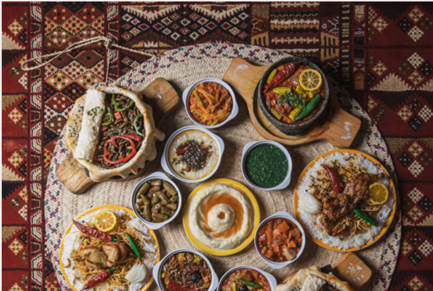
Traditional Culinary Dishes