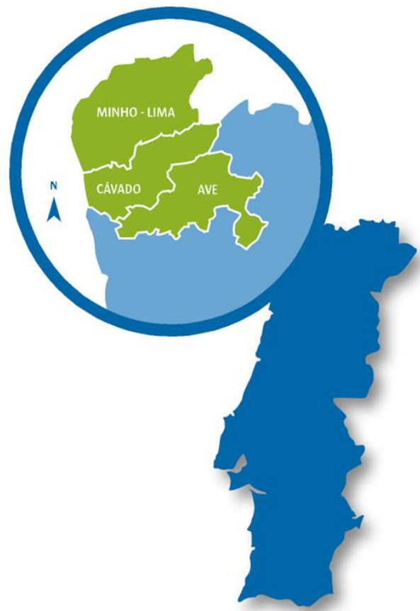
Map of Minho in the national context

The European Region of Gastronomy 2016 project represents an extraordinary opportunity for a long-term commitment to the development of this peripheral region of Europe and the improvement of the quality of life of its people, who has along the years dedicated effort and energy to preserve the traditional tangible and intangible heritage of this region of northern Portugal—known as MINHO.