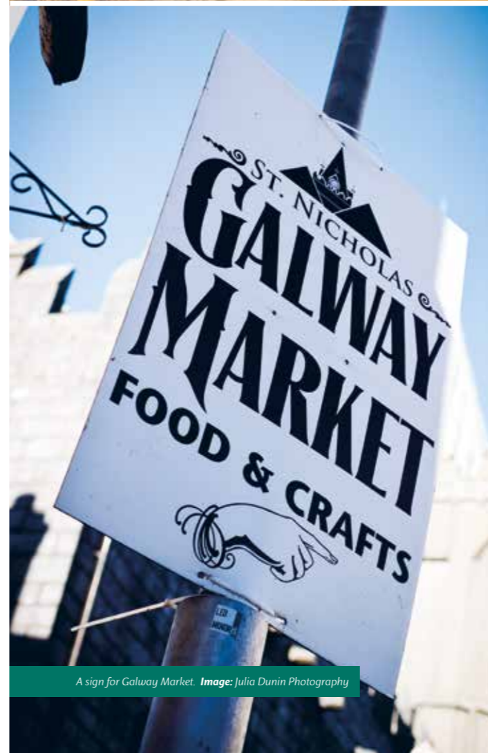
A sign for Galway Market. Image: Julia Dunin Photography