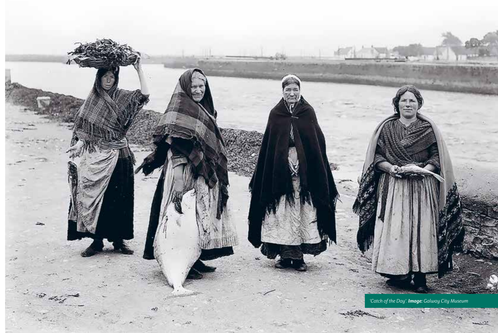
'Catch of the Day'.

We plan to extend these activities, along with the number of school and community gardens, in both the city and county. These growing spaces will not only enhance our urban environments and quality of life, but can be used as educational tools and as an actual source of fresh, wholesome food.