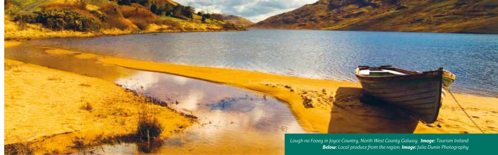
Lough na Foey in Joyce Country, North West County Galway. Below: Local produce from the region.

Our tourism industry is a major employer, bolstered by the hundreds of thousands of domestic and international visitors who flock to the city and county each year, attracted by our legendary hospitality, our stunning land- and seascapes, and the myriad of food, arts, culture and sporting festivals which have earned Galway the mantle of 'The Festival Capital of Ireland'.