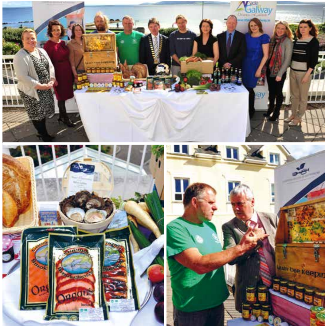
Members of the Galway, West of Ireland Steering Committee with Made in Galway at the consultative workshop in September 2015.