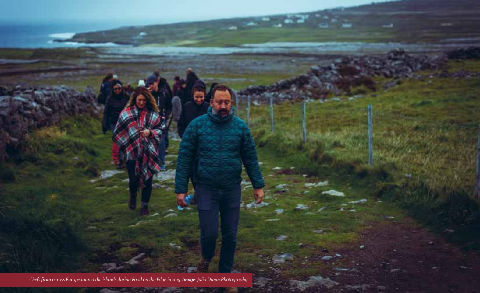
Chefs from across Europe toured the islands during Food on the Edge in 2015.