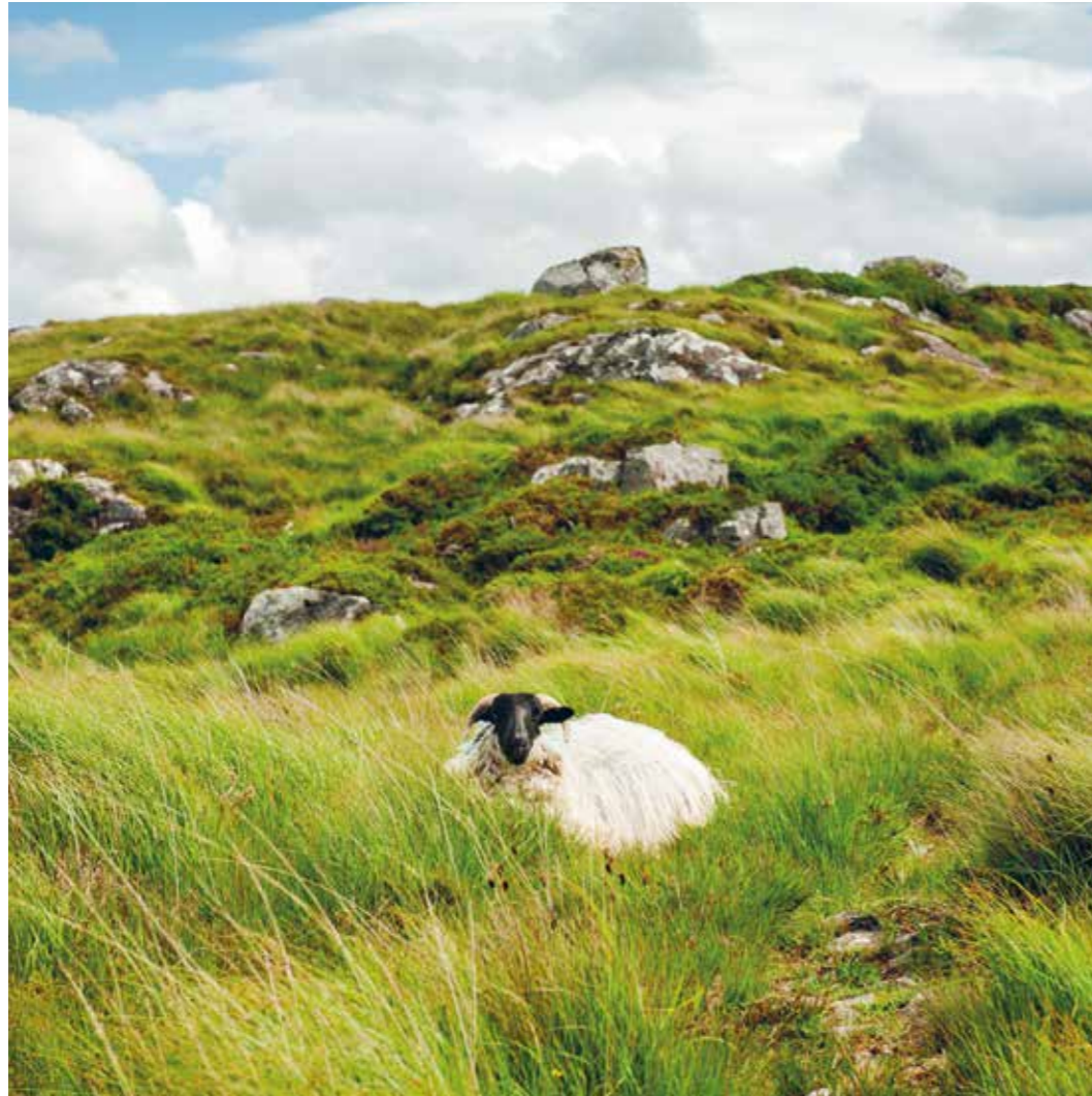
A black-faced mountain sheep at Derrigimlagh Bog, County Galway.